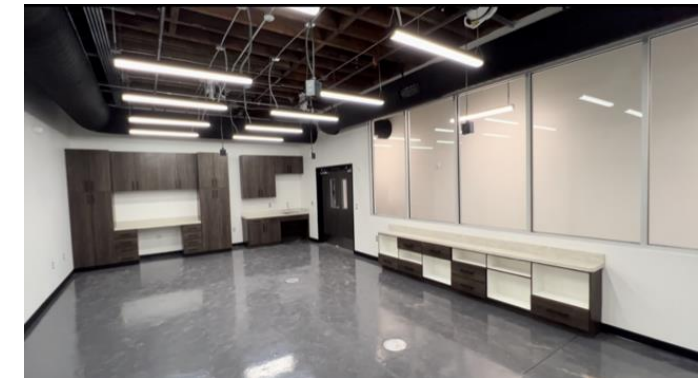
Photos of the back of house city office space (from top left to bottom right): conference room, open workstation area, dedicated leadership offices, maker space