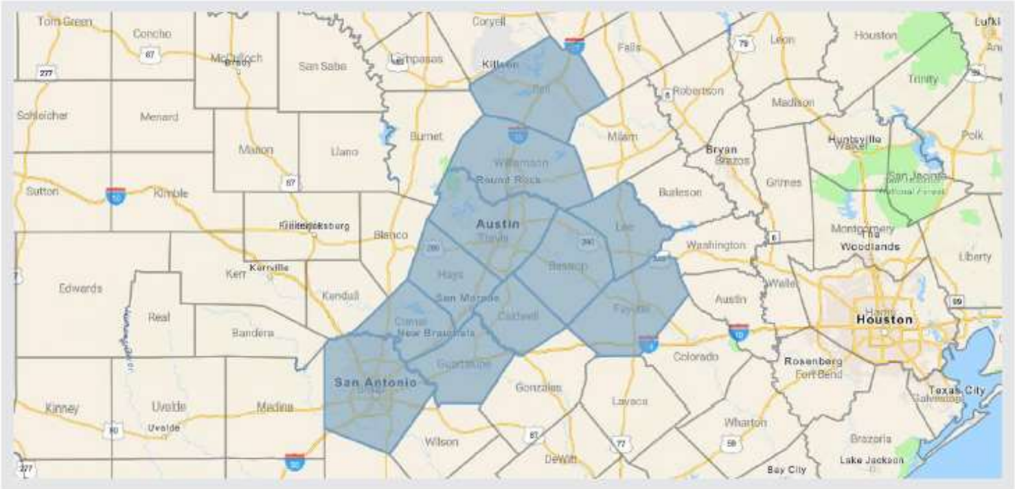
Figure 1. Bastrop 11-County Labor Shed