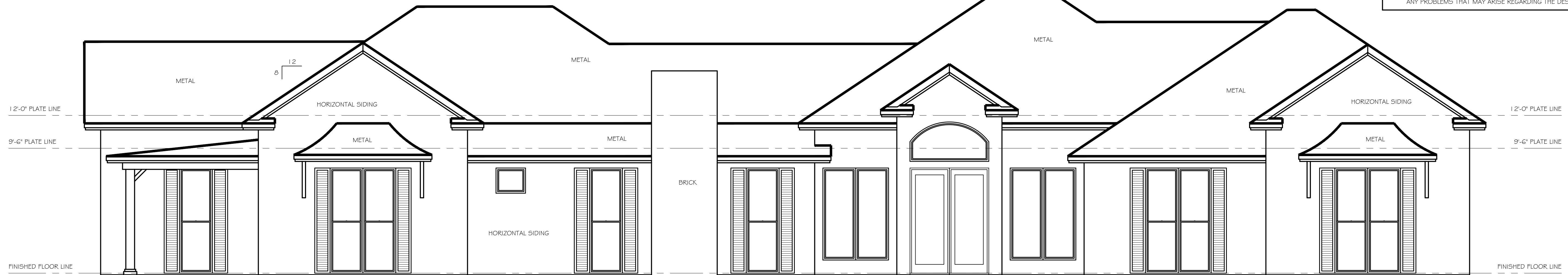
03 RIGHT SIDE ELEVATION REFERENCE: 01/A-1.1 SCALE: 1/4"=1'-0"

HAVEN DESIGN IS NOT AN ENGINEERING FIRM NOR AN ARCHITECTURAL FIRM. WE ARE NOT QUALIFIED NOR ARE WE LICENSED TO DESIGN STRUCTURAL FRAMING OR FOUNDATIONS. A LICENSED PROFESSIONAL ENGINEER SHOULD BE CONSULTED REGARDING STRUCTURAL FRAMING AND FOUNDATIONS. SHOULD AN ENGINEER'S SEAL BE PRESENT ON THE DRAWING, THEN THE ENGINEER OF RECORD SHALL BEAR THE SOLE RESPONSIBILITY FOR THE STRUCTURAL DESIGN. HAVEN DESIGN WILL NOT BE HELD RESPONSIBLE FOR THE STRUCTURAL DESIGN AND/OR ANY PROBLEMS THAT MAY ARISE REGARDING THE DESIGN.