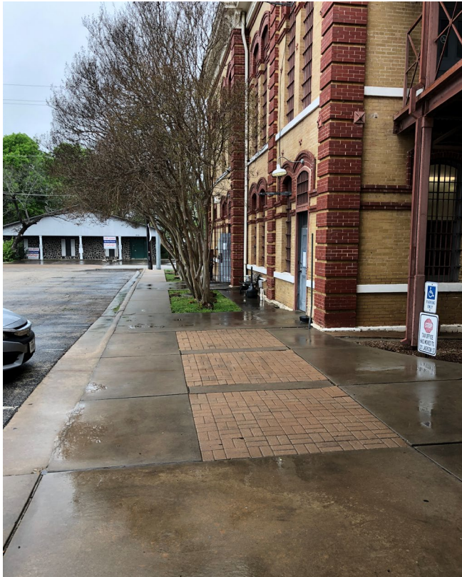
Photo 3: Perimeter of building will receive 2' wide concrete mow strip.