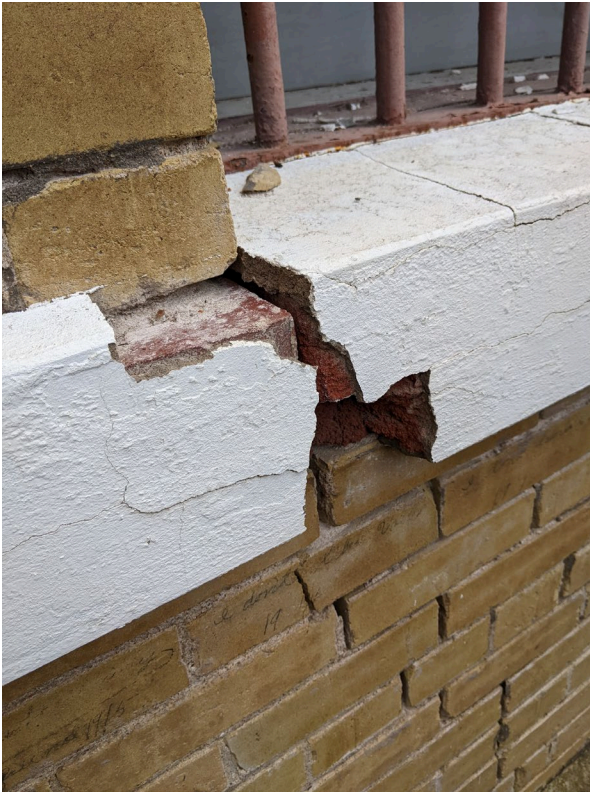
Photo 7: Parge coat to be restored 100%. Masonry restoration includes selective brick repairs/replacement, repointing 100%.