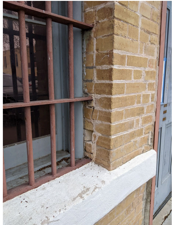
Photo 8: Parge coat to be restored 100%. Masonry restoration includes selective brick repairs/replacement, repointing 100%.