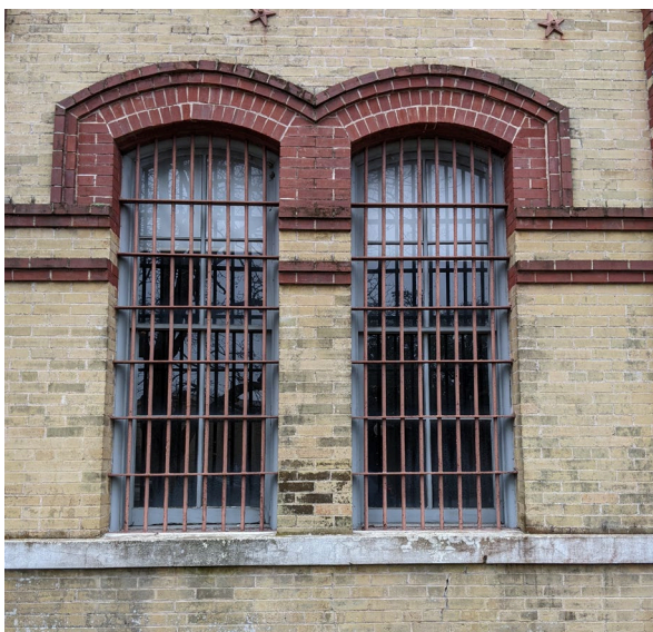
Photo 9: Windows and window grilles to be restored 100%. Masonry restoration includes selective brick repairs/replacement, repointing