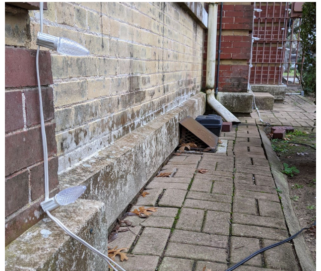
Photo 6: Existing brick pavers and covered crawlspace ventilation. Perimeter of building will receive 2' wide concrete mow strip.