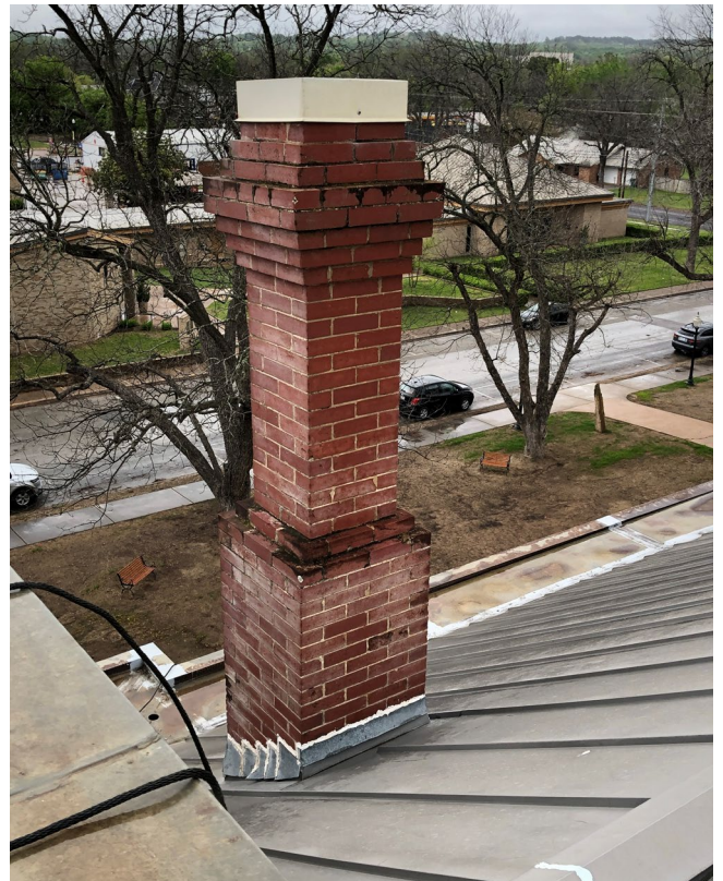
Photo 4: Existing sheet metal roofing to be replaced with slate roofing. Brick chimneys will be repointed 100%