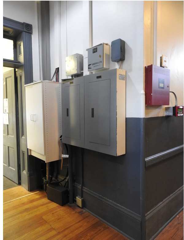
Photo 12: Electrical panels at first floor entry hall to be relocated.