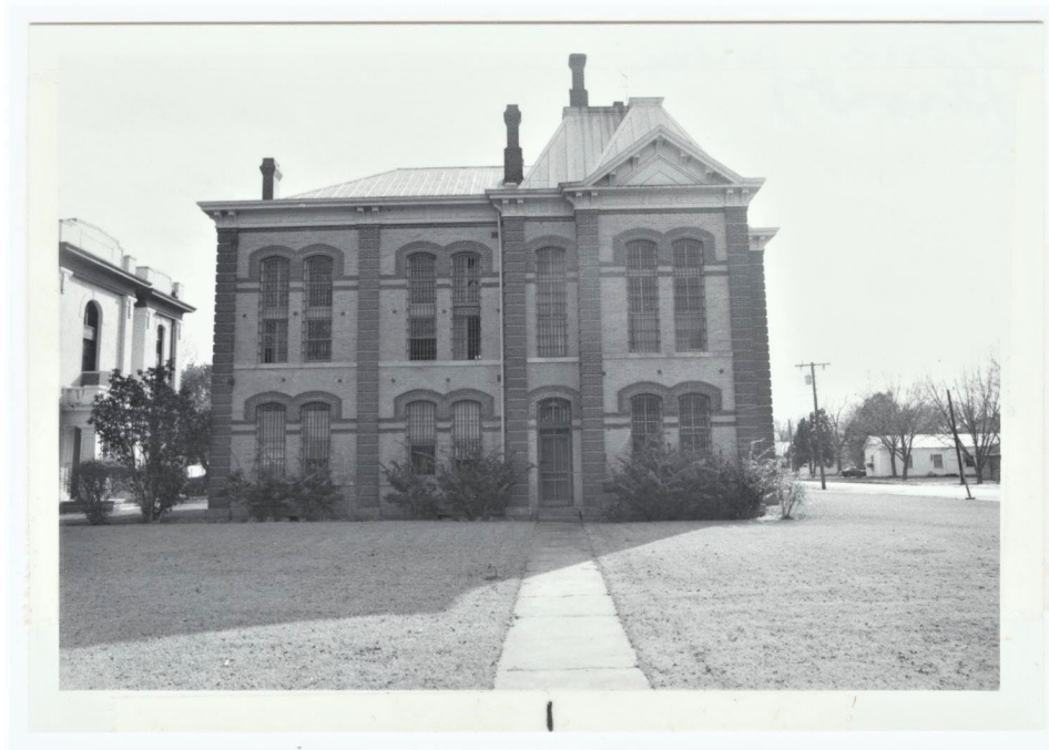
Photo 1: North Elevation, 1977