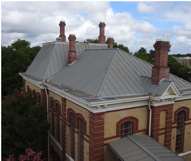
Photo 5: Existing sheet metal roofing to be replaced with slate roofing. Brick chimneys will be repointed 100%