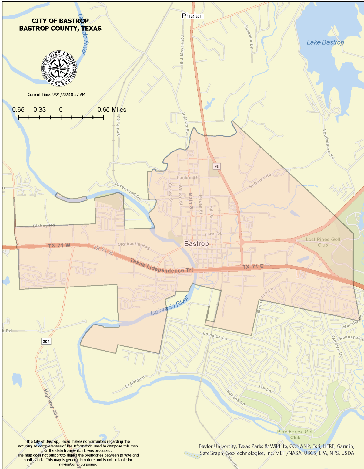
EXHIBIT A AREA FOR AUTOMATIC RESPONSE BY THE CITY OF BASTROP