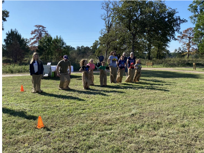
Movie in the Park – Veteran Family Appreciation Month. Partnered with Bastrop County Cares.