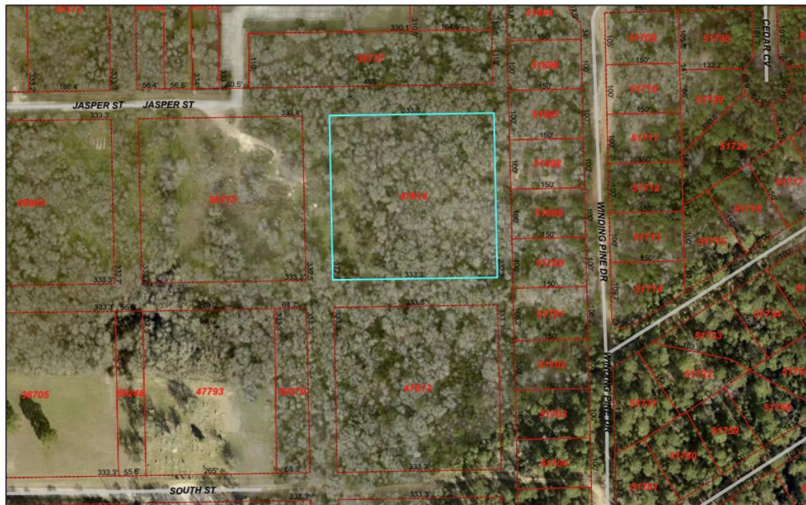
Bastrop CAD Web Map