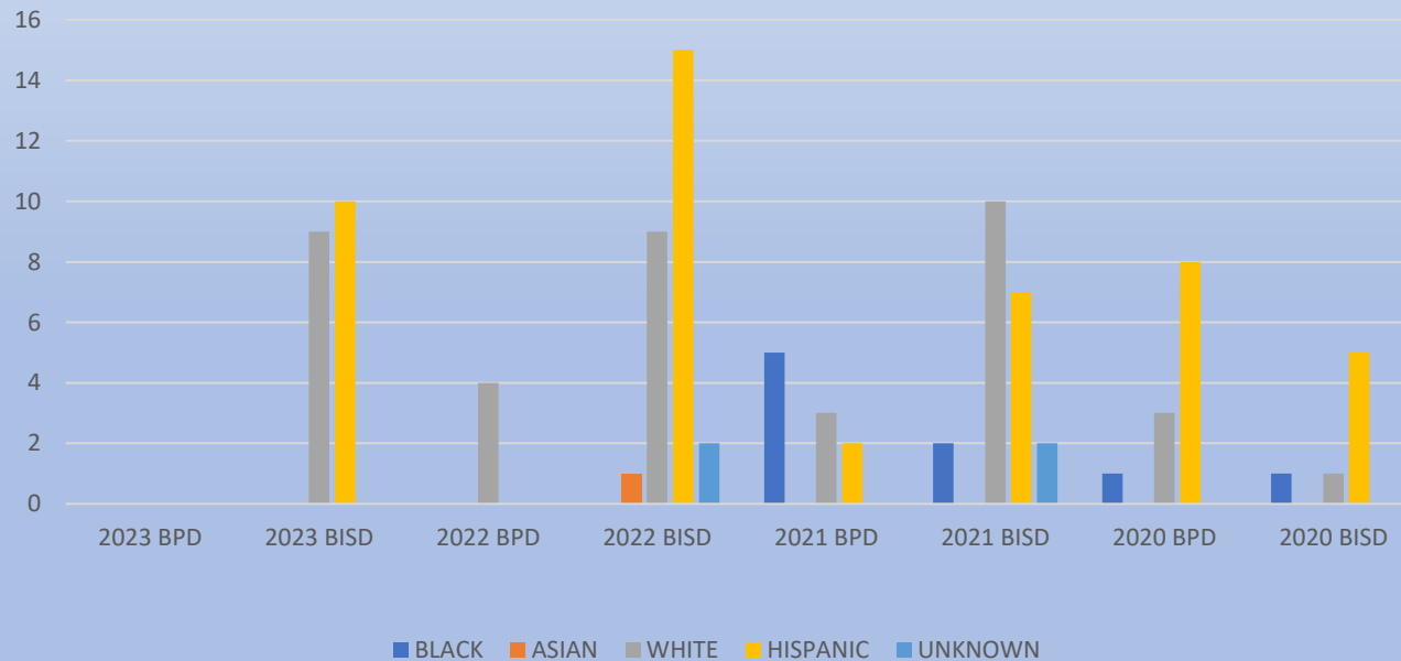
Juvenile Curfew by Race