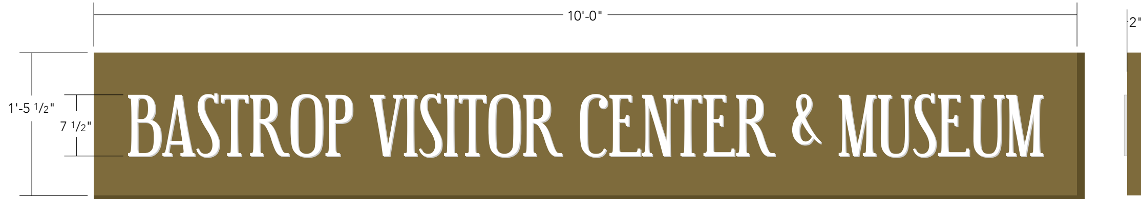
A | Proposed Construction 1 | Scale: 1" = 1'