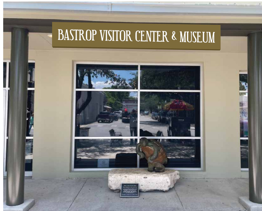
A | Proposed Elevation 2 | Scale: NTS