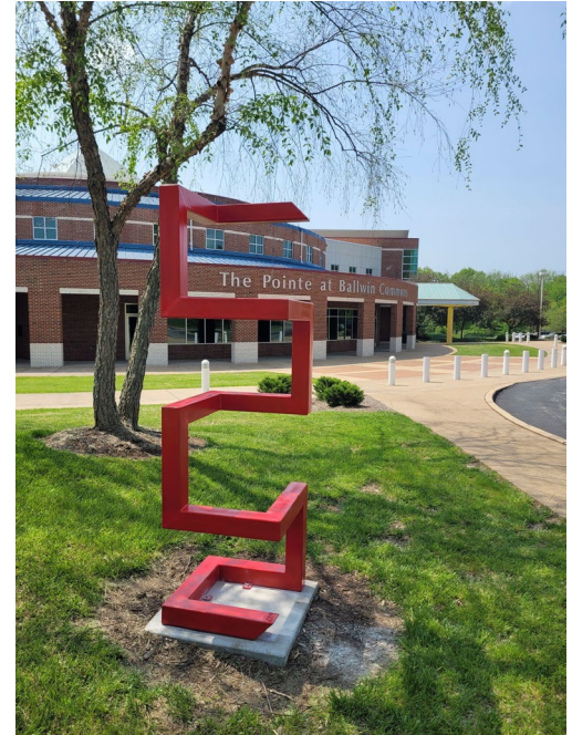
("Square One" art on loan program)