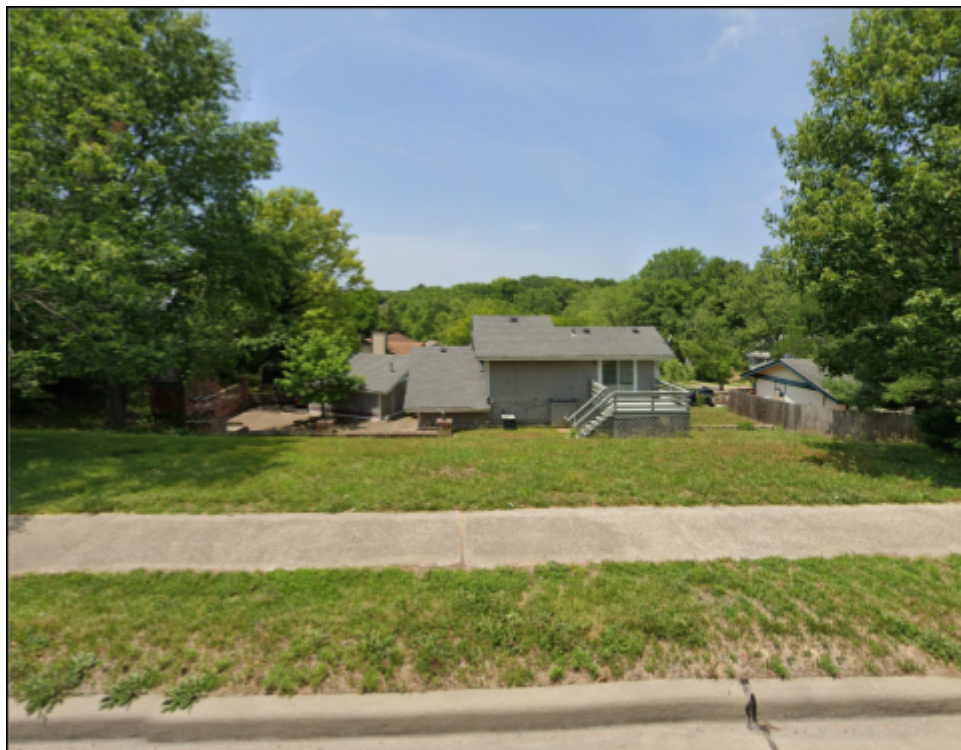
Figure 2 - Looking at the property from Ries Road