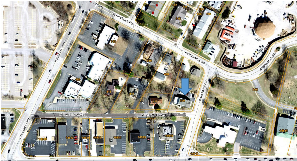
Figure 1: Map View of the location of 109 Ballpark Dr.