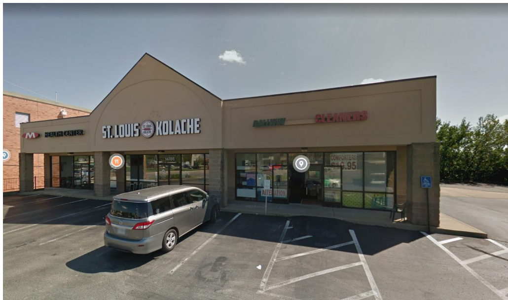
Figure 2: Front view of Site, Aug 2018. Proposal would use the former Ballwin Cleaners suite shown on the right end of the strip.