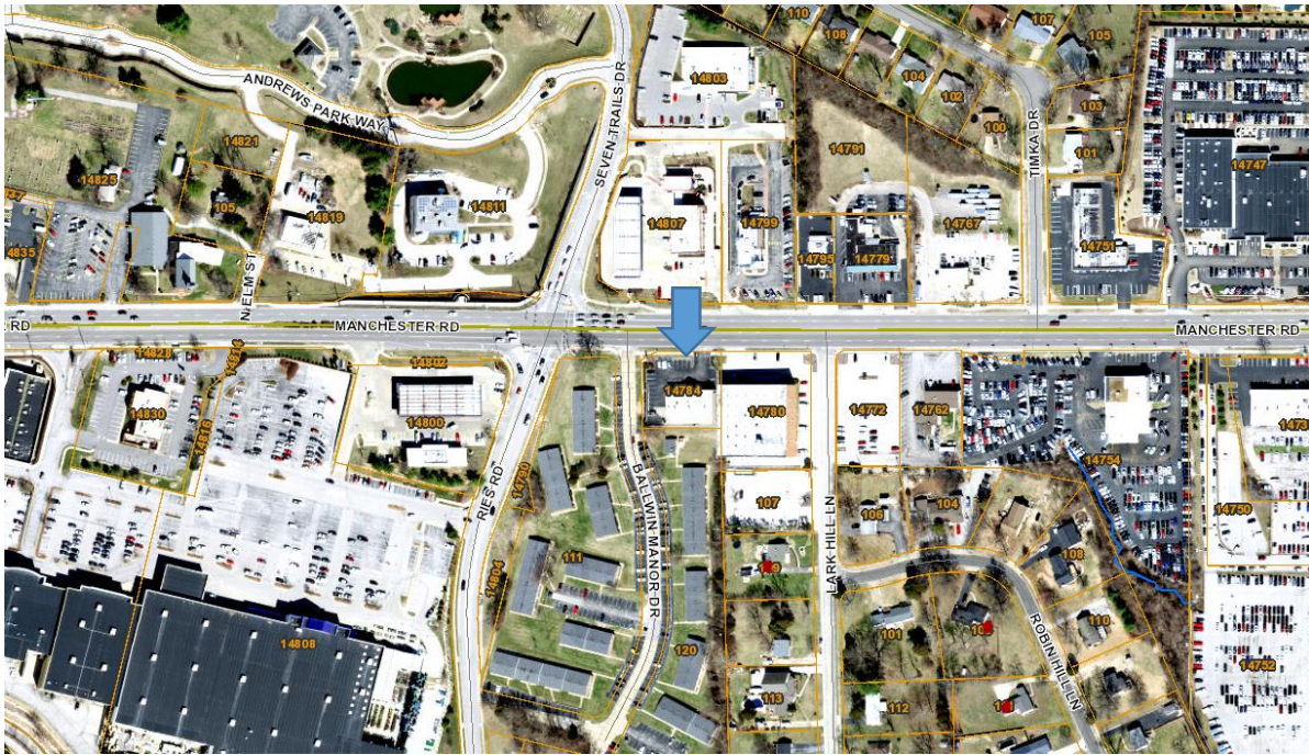
Figure 1: Map View of the location of 14788 Manchester Rd.