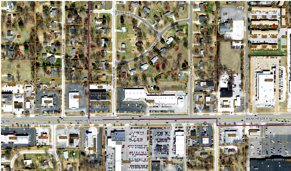
Figure 1 Map View of the location of 15581 Manchester Rd.