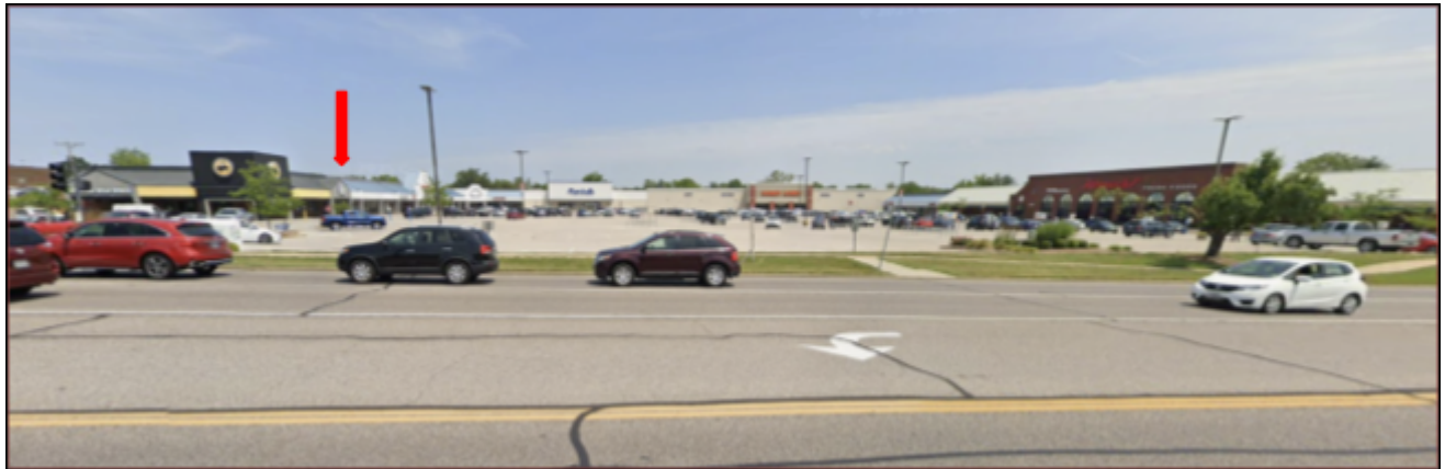
Figure 2 - Street view of the development. The proposed location is indicated by a red arrow.