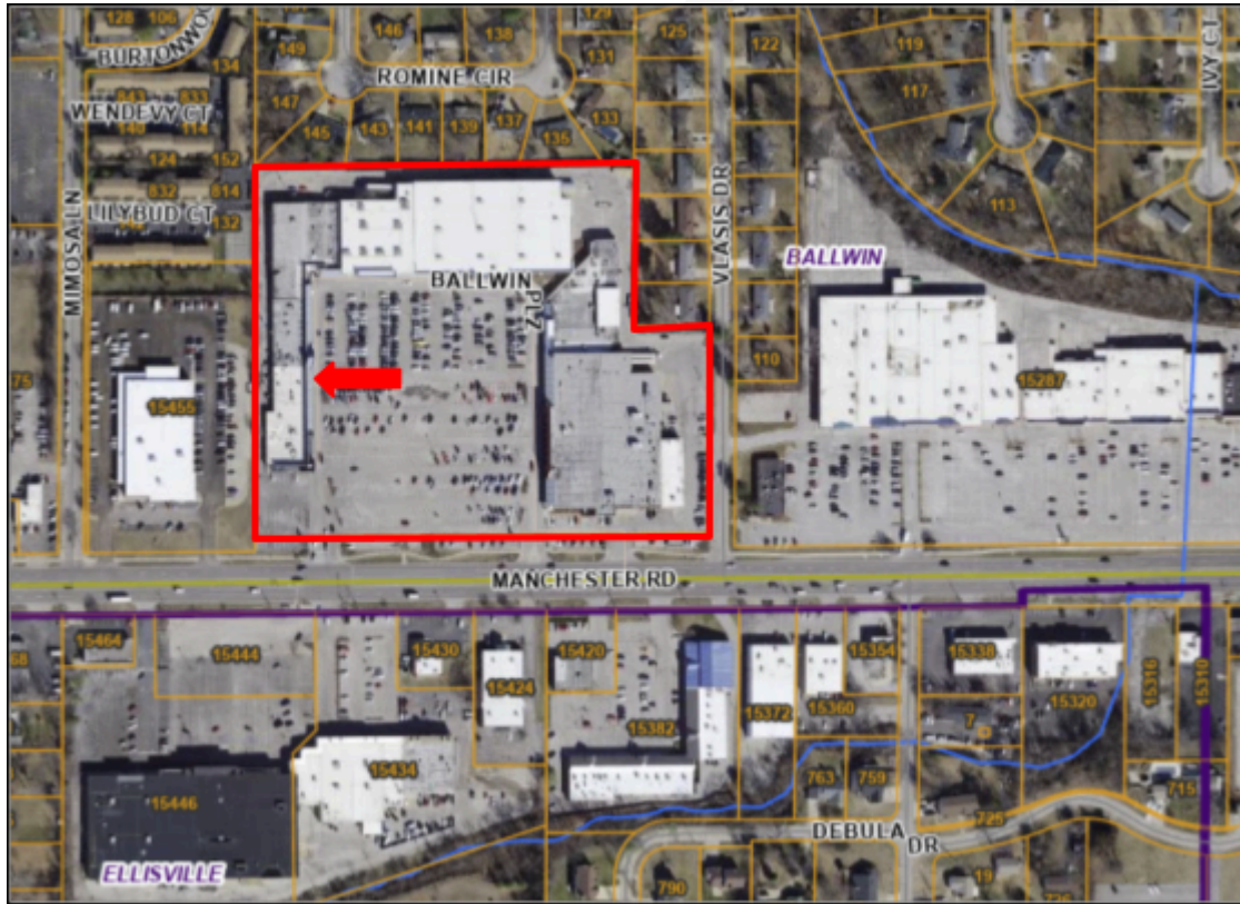
Figure 1 - Aerial view of the site and surrounding properties. The proposed location is indicated by a red arrow.