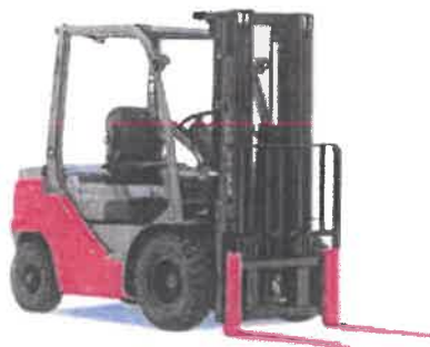
Photo may portray optional equipment not included in your quotation.