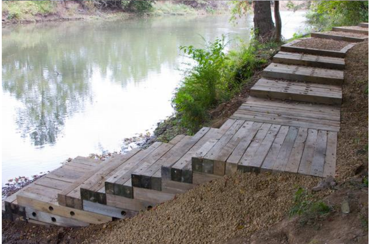
Mill Creek at Elm Hill Pike