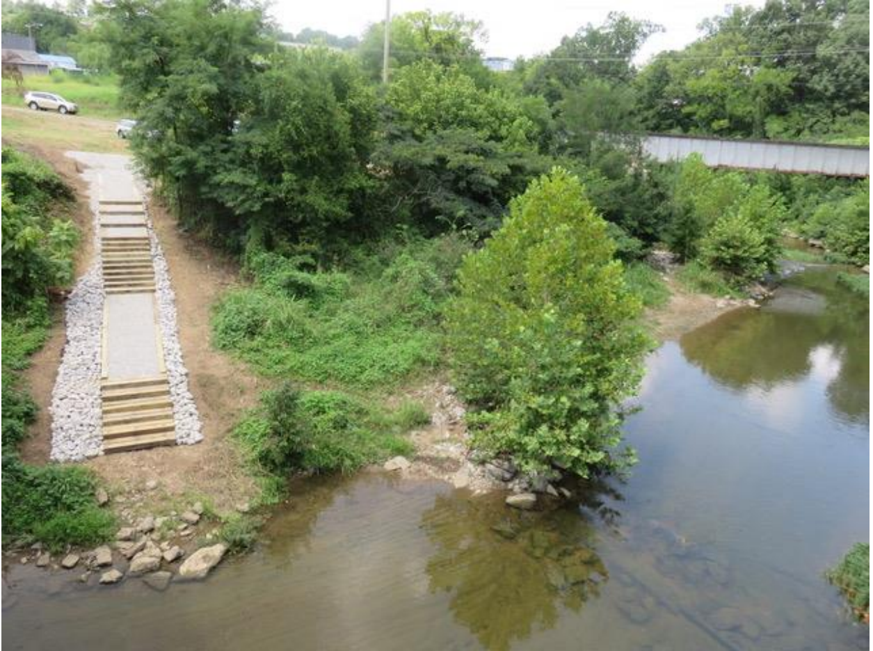
Lewisburg Pike on the Harpeth