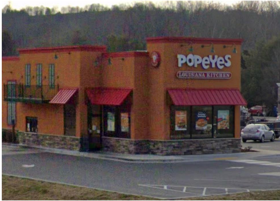
and city, Tennessee