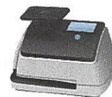
Francotyp-Postalia PostBase™ mini