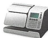
Quadient IS-280 iMeter™