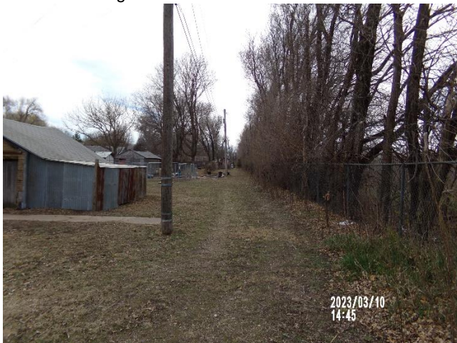
Alleyway provides sufficient access for utilities