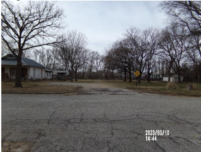
Taylor Avenue looking West