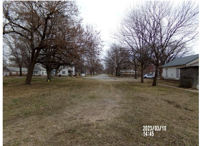
Taylor Avenue looking East