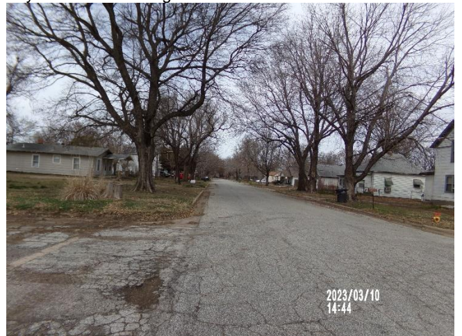
G Street looking North