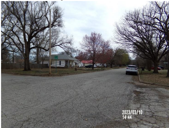
G Street looking South