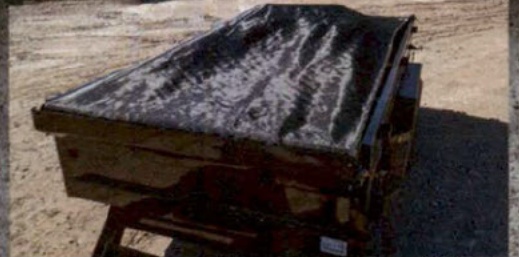
Retractable Turle Tarp