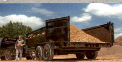
3' or 4' Sidewalls