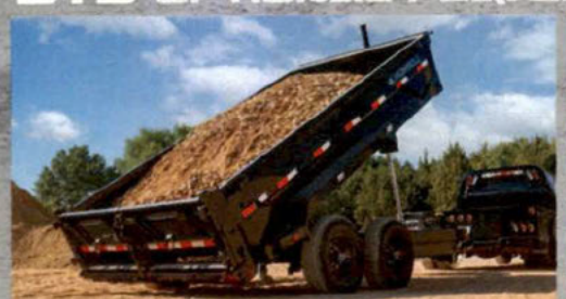
3 Stage Telescopic Cylinder