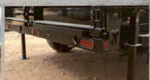
Rear Stabilizer Jacks