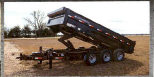
Available three 7k Axles