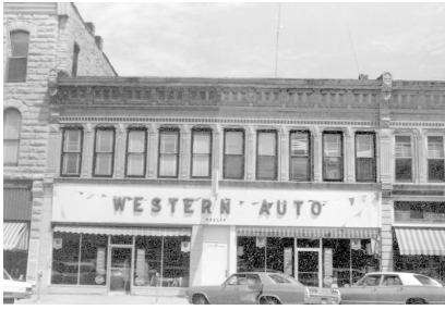
Eagle Block. 312-314 S Summit. Principal Elevation. ca. 1970.