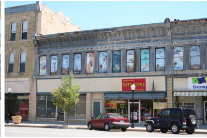
Eagle Block. 312-314 S Summit. 07/24/2009.