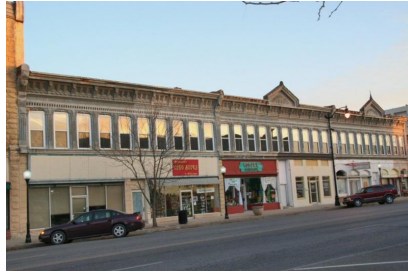
Eagle Block. 312-314 S Summit. East side of 300 block with 312-314 at North end (L). 12-11-2017.