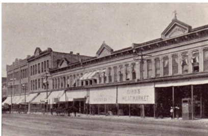
Eagle Block. 312-314 S Summit. ca.1919 Historic View. Arkansas City Illustrated. Ark City: Cornish Photography Studio (1919) scanned by CC Historical Museum.