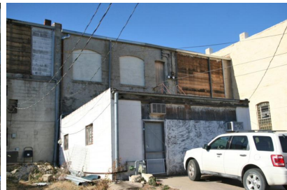
Eagle Block. 312-314 S Summit. East/rear facade. 12-11-2017.