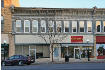
Eagle Block. 312-314 S Summit. Front/west facade. 12-11-2017.