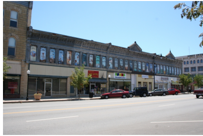
Eagle Block (left) and Summit Block, looking SE. 312-322 S Summit. 07/24/2009.