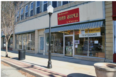
Eagle Block. 312-314 S Summit. South storefront on west facade. 12-11-2017.