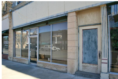
Eagle Block. 312-314 S Summit. Center entrance and north storefront on west facade. 12-11-2017.