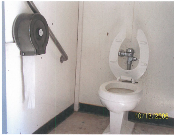
Toilet stalls are too narrow and have improper grab placements and lack bars on rear walls.