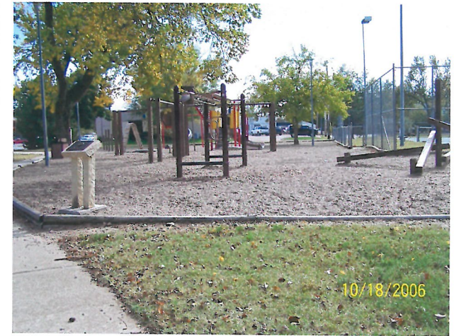
The playgrounds are not on an accessible route and lack accessible components.