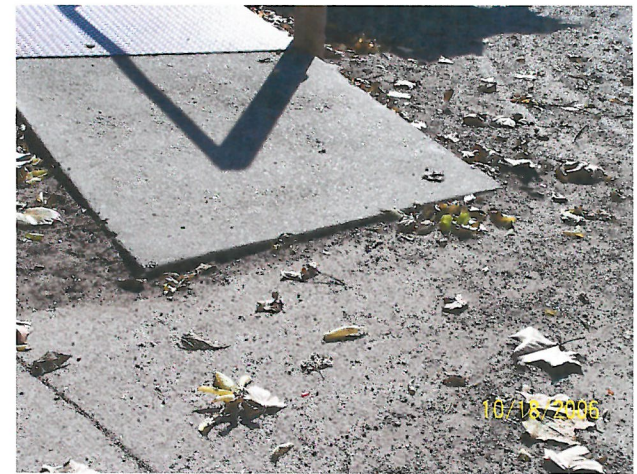
The women's restroom ramp has an excessive threshold.