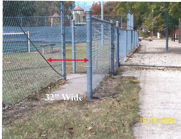
These routes to tennis court entrances are too narrow.