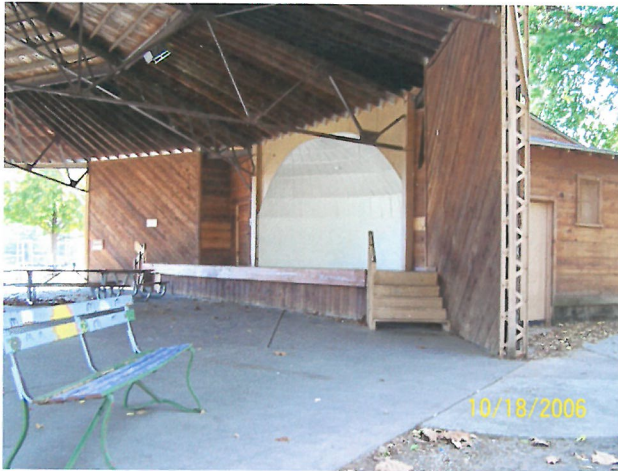
The shelter's amphitheater/stage is not accessible.