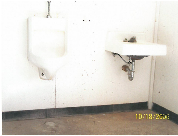
There is enough wall space in the men's restroom to widen the toilet stall. The urinal rim is too high and the lavatory has round faucet controls and exposed drain pipes.