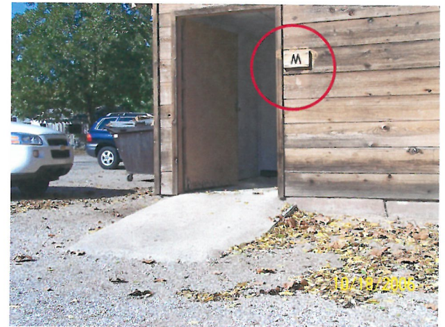
This ramp at the men's restroom is too steep, lacks edge protection, handrails and slopes to the doorway. The sign is mounted too high and is not in an accessible format.