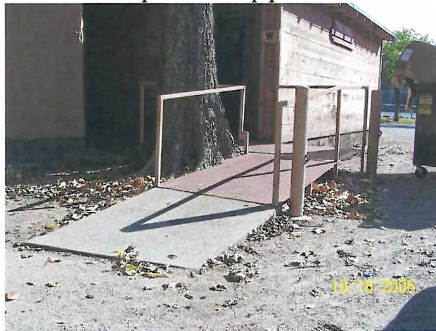
This ramp at the women's restroom is too steep, lacks adequate handrails and edge protection.