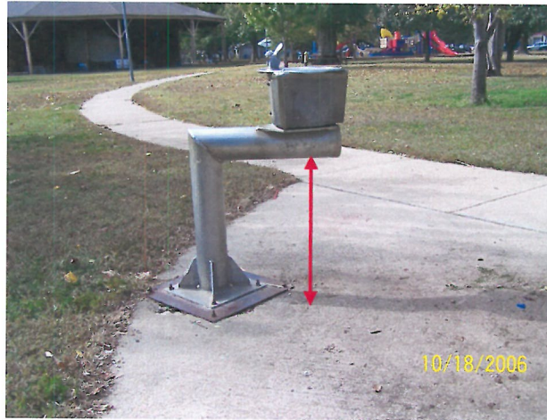
This drinking fountain does not have adequate knee clearance.