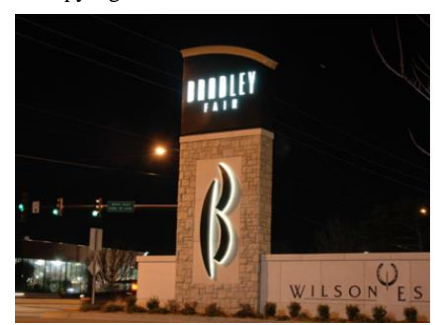
Pylon with creative elements