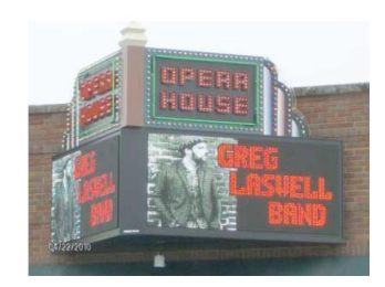
Marquee with creative elements