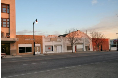
R & K Motor Co. 412 S. Summit. East side 400 block S. Summit. 12-11-2017.