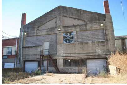
R & K Motor Co. 412 S. Summit. East/rear facade. 12-11-2017.