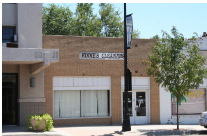
408 S Summit. Principal Elevation. 07/24/2009.