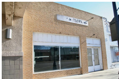
408 S. Summit. Front/west facade. 12-11-2017.