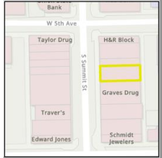
Map data ©2022 Esri World Topographic map

The subject property is located at 208 S Summit Street. The proposed project is an unlit polymetal sign mounted above the storefront on the sign board. A portion of the sign will be backlit channel letters. Staff recommends approval of the sign per the Guidelines for Signs in Historic Districts and Individually Listed properties in accordance with KSA 75-2724, Kansas State Historic Preservation Law.