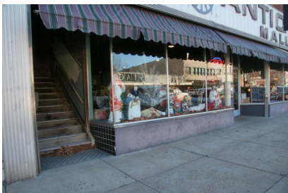
Zadie Building. 206-208-210 S Summit. 208-210 storefront on west facade with street access to 2nd floor. 12-12-2017.