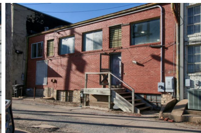
Zadie Building. 206-208-210 S Summit. East/rear facade of 208-210. 12-12-2017.