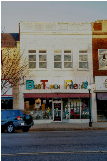
Zadie Building. 206-208-210 S Summit. Front/west facade of 206. 12-11-2017.