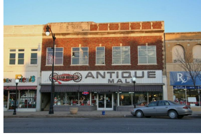
Zadie Building. 206-208-210 S Summit. Front/west facade of 208-210. 12-11-2017.