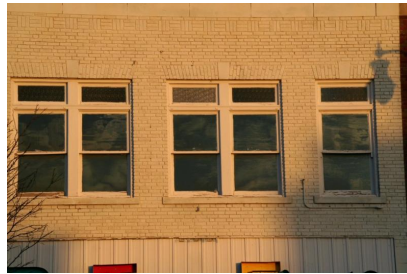
Zadie Building. 206-208-210 S Summit. 206 retains original upper windows. 12-11-2017.