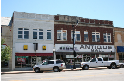
Zadie Building. 206-208 S Summit. Principal Elevation. 07/24/2009.