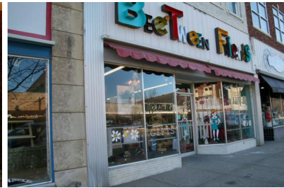
Zadie Building. 206-208-210 S Summit. 206 storefront on west facade. 12-12-2017.