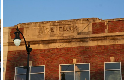
Zadie Building. 206-208-210 S Summit. Inscribed parapet over center bay on west facade. 12-11-2017.