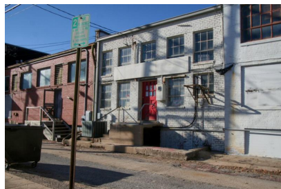
Zadie Building. 206-208-210 S Summit. Rear/east facade with 206 (white) on north. 12-12-2017.