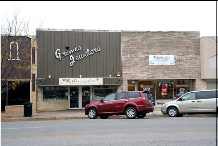
Front/east facade (113 on left). 11/14/2017. B. Spencer