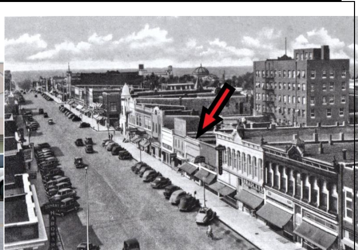
1940 Historic View. Emphasis of arrow added.