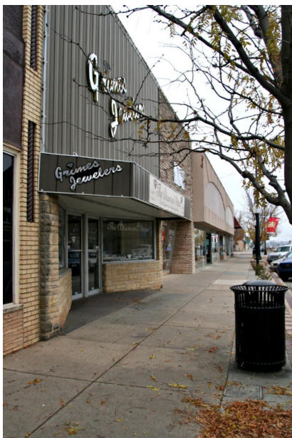
113 S. Summit. Storefront looking north. 11/14/2017. B. Spencer