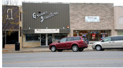
113 S. Summit. Front/east facade (113 on left). 11/14/2017. B. Spencer