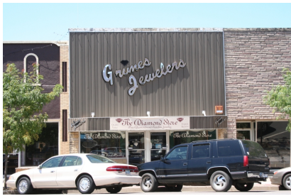
113 S Summit. Principal Elevation. 07/24/2009.