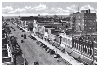
113 S. Summit. 1940 Historic View. Images: A Pictorial History of Cowley County Vol. II (2001) scanned by Cowley Co. Historical Museum.