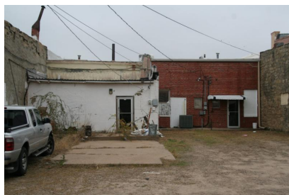
113 S. Summit XX 11/14/2017 B. Spencer