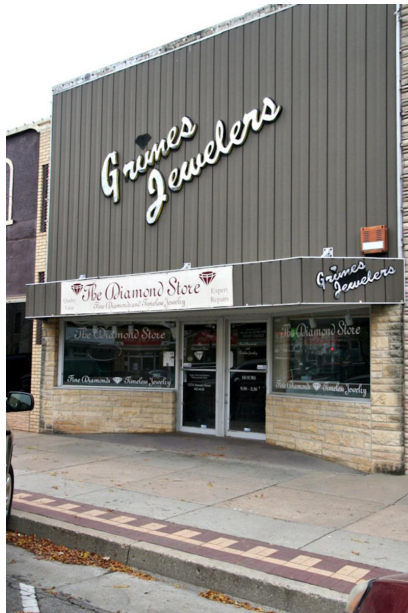
113 S. Summit Front/east facade. 11/14/2017. B. Spencer