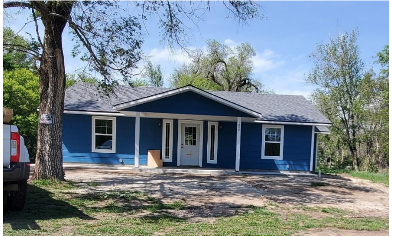
House with orange cross showing required height