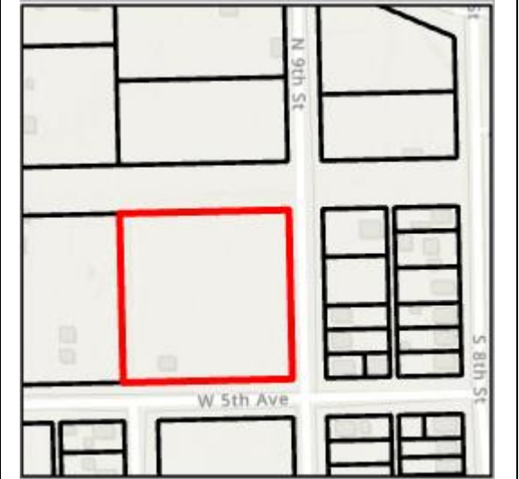
Map data ©2023 Esri World Topographic map

Marcela Jimenez has requested a variance to allow the construction of a home 1.75 feet below the required elevation of 1071.0 feet at 1020 W 5 th Avenue. The property is currently developed with one home. The area surrounding the property is residential. Due to an error in measuring, the home was built lower than required. The required elevation is one foot above the base flood elevation of 1070.0 feet. The options to remedy this situation are limited. The first option is to elevate the home. The second option is to relocate the home to a site that is not in the floodplain. The homeowner has been made aware that if the variance is approved, the house will remain in non-conformance with FEMA regulations, and this will require a much higher premium on flood insurance. Based on site observations and historical knowledge, it appears likely that the base flood elevation is too high and should be adjusted downward which may mean the property will be brought into compliance administratively in the future, but staff must enforce current regulations including the current base flood elevation regardless of that.