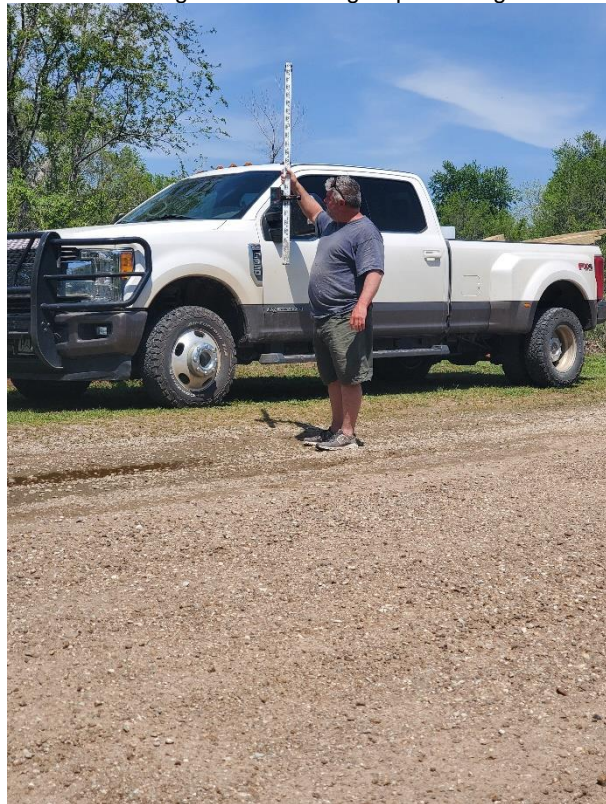
Bottom of stick shows required elevation at road level