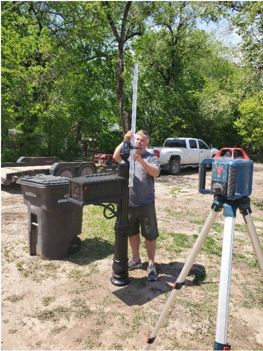
Bottom of stick shows required elevation in relation to mailbox