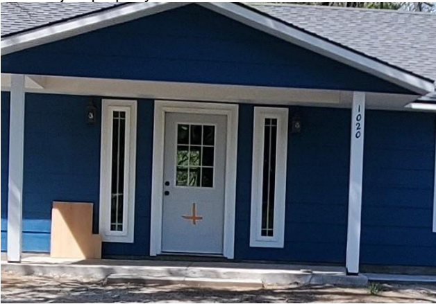
Close up view of orange cross marking required elevation