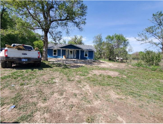
The subject property-1020 W 5 th Ave