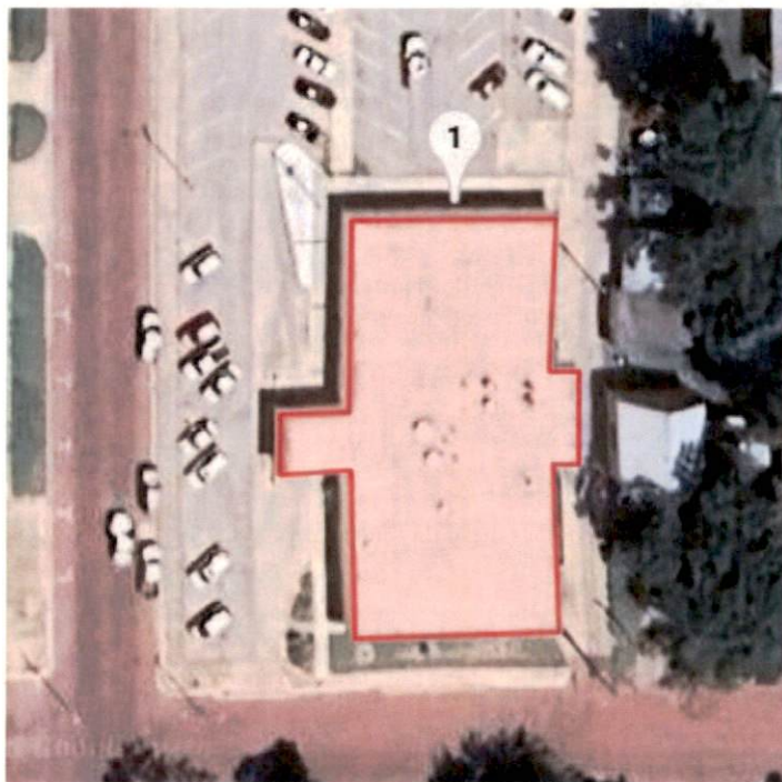
Roof Key Plan