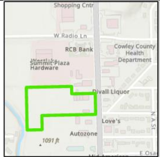
Map data ©2024 Esri World Topographic map

The subject property is located at 1745 & 1801 N Summit. The property has a shopping center and quick service restaurant and vacant land. The surrounding area is comprised of commercial uses. The rear vacant portion is partially within the floodplain and floodway. The property consists of approximately 6.16 acres. The project will be to split the shopping center/restaurant and vacant land into separate lots. Easements will be provided for existing utilities and access in the form of a separate instrument entitled Declaration of Reciprocal Easements, Covenants, Conditions and Restrictions recorded at Book 1131, Pages 38-42 with the Cowley County Register of Deeds.