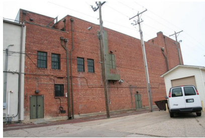
110-114 S. Summit. East/rear facade. 11/14/2017. B. Spencer