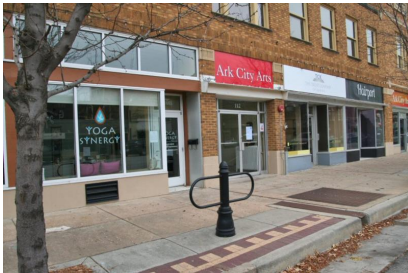
110-114 S. Summit. Storefronts looking south from north end. 11/14/2017. B. Spencer