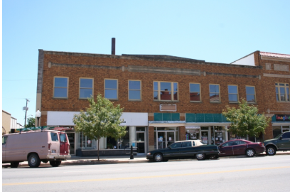
Burford Commercial Center. 110-114 S Summit St. 07/2009.