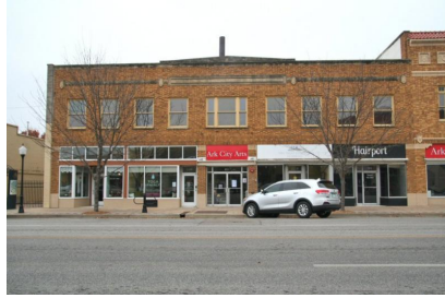
110-114 S. Summit. Front/west facade. 11/14/2017. B. Spencer