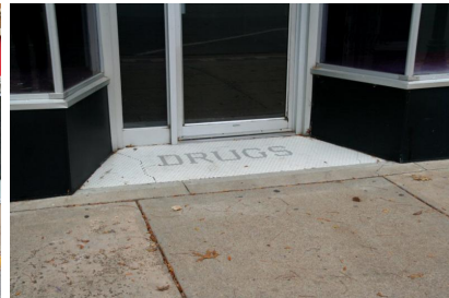
110-114 S. Summit. Cararra glass bulkhead and hex tile at recessed entry at south storefront bay. 11/14/2017. B. Spencer