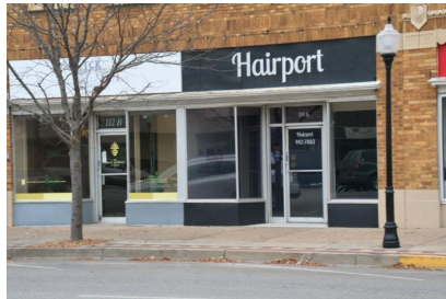
110-114 S. Summit. Detail of south storefront. 11/14/2017. B. Spencer