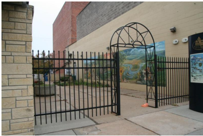
110-114 S. Summit. North facade fronts vacant lot north of building. 11/14/2017. B. Spencer