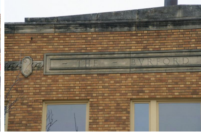
110-114 S. Summit. Detailing on parapet of west facade. 11/14/2017. B. Spencer