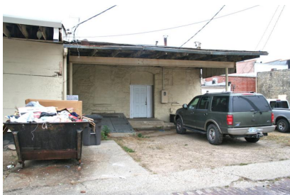
111 S. Summit. West/rear facade. 11-14-2017.