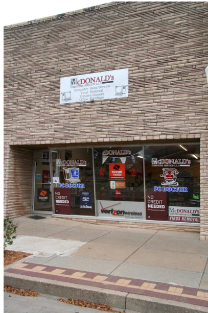
111 S. Summit. Front/east facade. 11-14-2017.