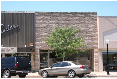
111 S Summit. Principal Elevation. 07/24/2009.