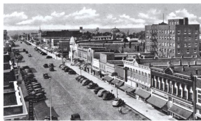
111 S. Summit. 1940s Historic View.