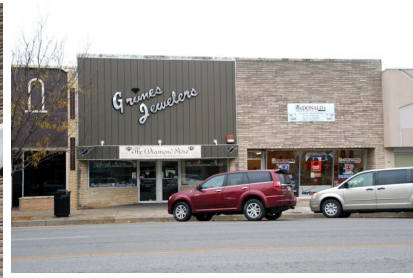
111 S. Summit. Front/east facade (111 on right). 11-14-2017.