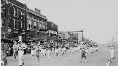
Historic View Kress Building ca. 1928.