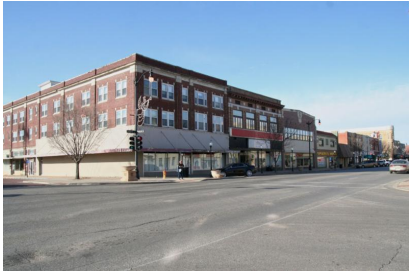
321 S. Summit XX 12/11/2017 B. Spencer