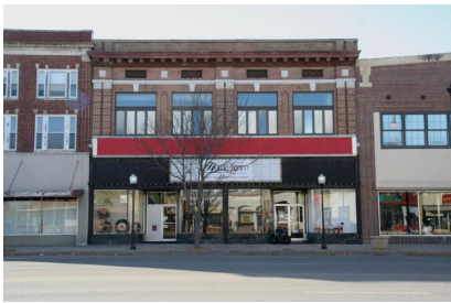
321 S. Summit. Front/east facade. 12/11/2017. B. Spencer