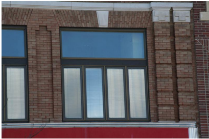
321 S. Summit. Detail of upper windows on east facade. 12/11/2017. B. Spencer