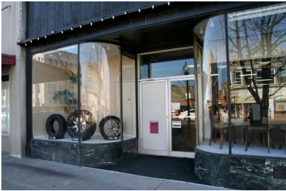
321 S. Summit. Curved granite bulkhead at storefront. 12/11/2017. B. Spencer