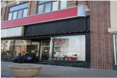
321 S. Summit. Storefront on east facade. 12/11/2017. B. Spencer