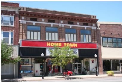
321 S Summit. Principal Elevation. 07/24/2009.