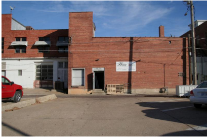
321 S. Summit XX 12/11/2017 B. Spencer