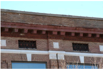
321 S. Summit. Detail of cornice and parapet on east facade. 12/11/2017. B. Spencer