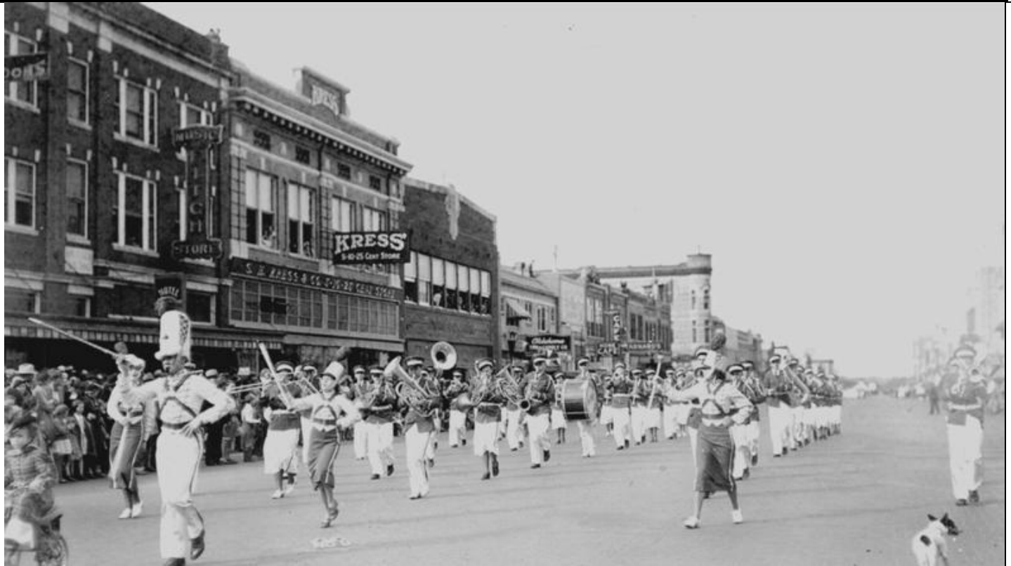
Historic View Kress Building ca. 1928.