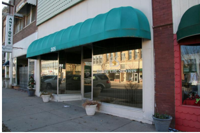
305 S. Summit Storefront looking south. 12/11/2017. B. Spencer