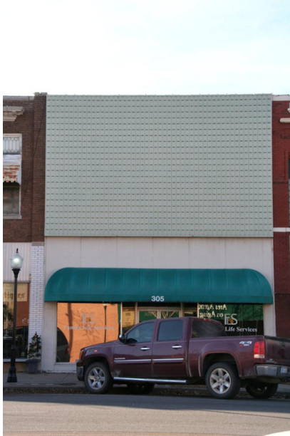
305 S. Summit. East facade. 12/11/2017. B. Spencer