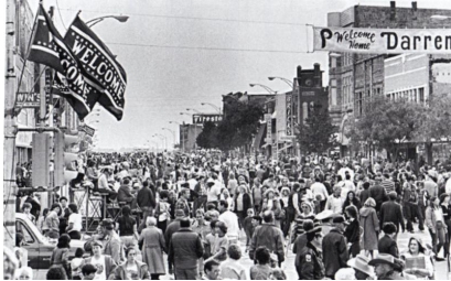
305 S. Summit. 1983 Historic View.