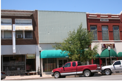
305 S Summit. Principal Elevation. 07/24/2009.