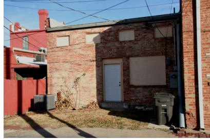
305 S. Summit. West/rear facade. 12/11/2017. B. Spencer