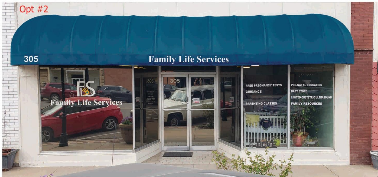
8/1/2025 with added graphics