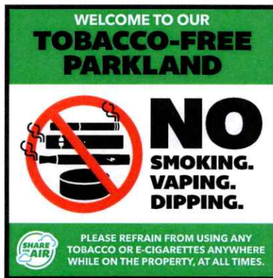
Decals - 8" x 8"