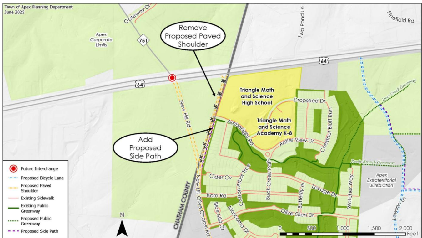
Figure 1. Proposed amendments to the Bicycle and Pedestrian System Plan Map

A map of the proposed Plan amendments are displayed in Figure 1.