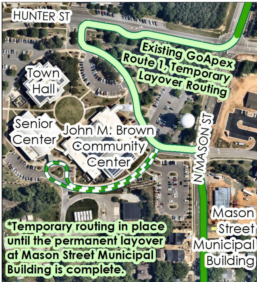
Figure 2. Close-in diagram of proposed amendment