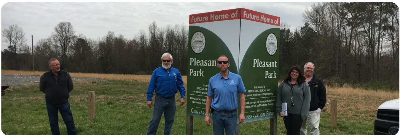
➤ Figure 11.3- Pleasant Park (Under Construction)

The implementation plan also includes a status update on each of the action items to keep track of the progress and remove the action items from the plan once they are completed. The status categories include Perpetual, In Progress, On Hold, Not Started, and Completed. The Town can consider developing an “implementation plan team” to ensure accountability and consistent progress over the ten-year planning horizon. The implementation team will be responsible for congruency with other town-wide planning efforts, identifying priority capital projects and funding sources, and developing annual progress reports. An annual progress report is helpful for the Department’s internal operations and staff motivation as well as communicating the success to elected officials and public at large. It also sets the stage for next year’s project priorities, staffing, and funding allocations. The implementation team will also take account of any emerging issues, trends, community’s changing desires etc. in the annual report.