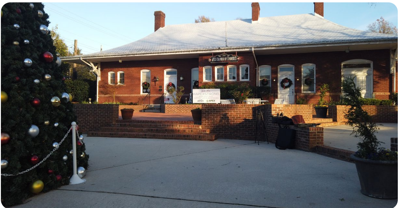
Figure 11.1- Downtown Deport Plaza

As the Town continues the implementation process over the next decade, many projects will evolve based on changing recreation trends, availability of funding, and the needs of a growing community. When there are many opportunities and competing interests, it is difficult for decision makers to prioritize and implement projects. Hence, this plan sets forth implementation guidelines for use as a decision-making tool for staff and elected officials. This approach informs and validates decisions through data and community values, leading to statistically-based projects and consensus among stakeholders.