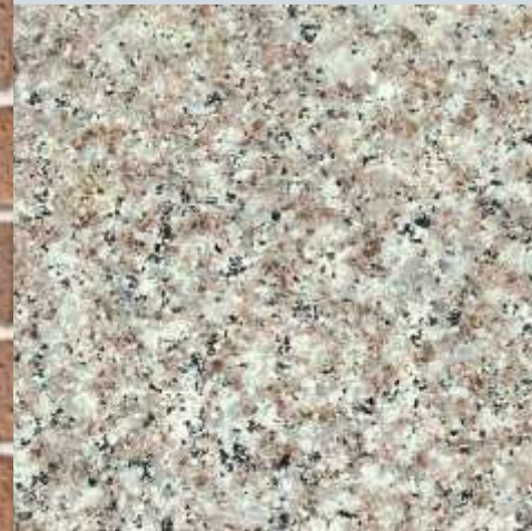
Light Granite Niche Covers