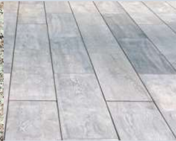
Grey Plank Style Paver