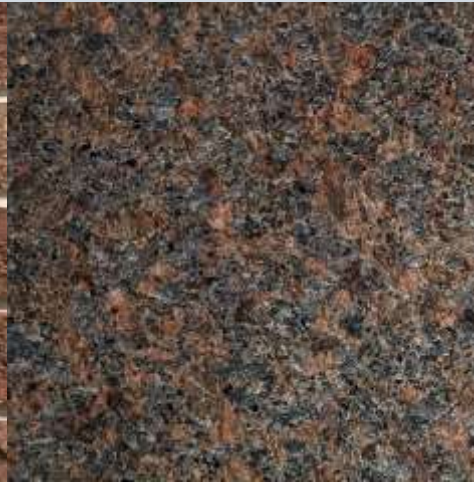
Dark Granite Niche Covers