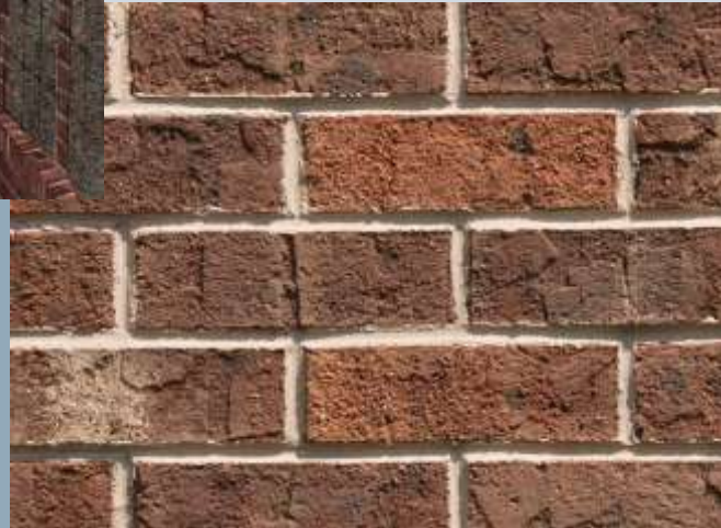
Georgian Red Brick