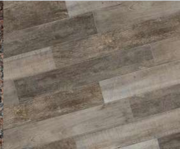
Ember Plank Style Paver