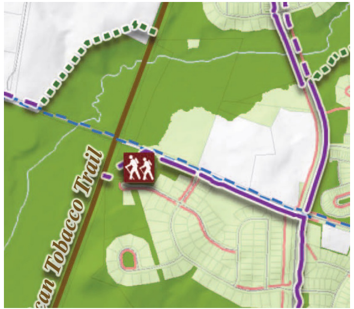
BICYCLE AND PEDESTRIAN SYSTEM PLAN MAP