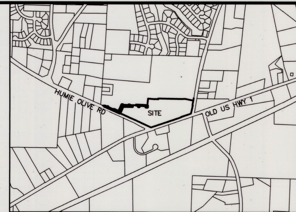
VICINITY MAP -NOT TO SCALE