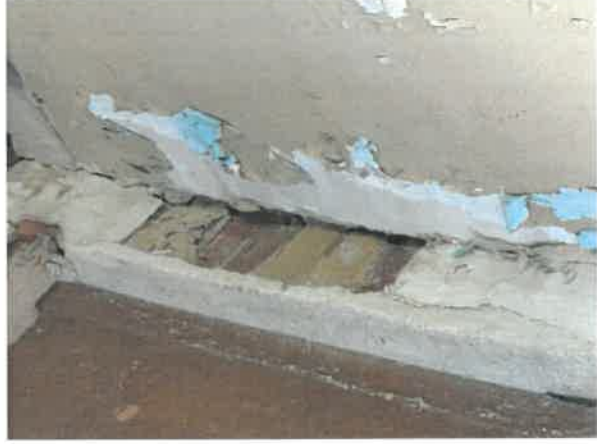
Corner on party wall from 206 side