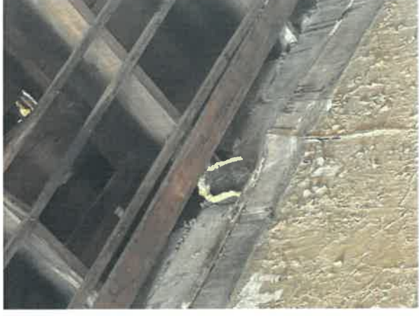
Interior 206 along party wall to 208