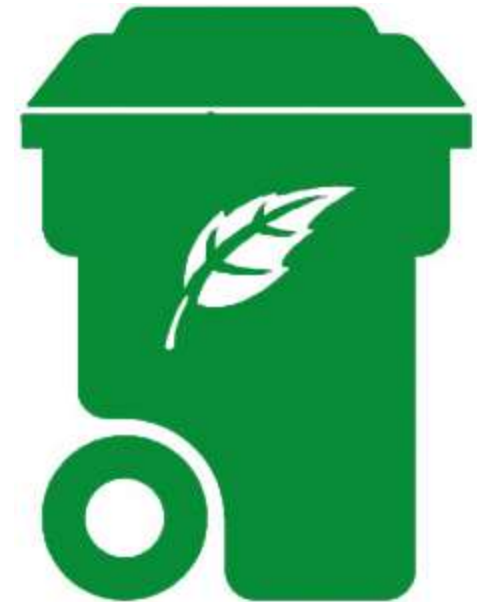
65 gal GREEN WASTE Collection bi/weekly