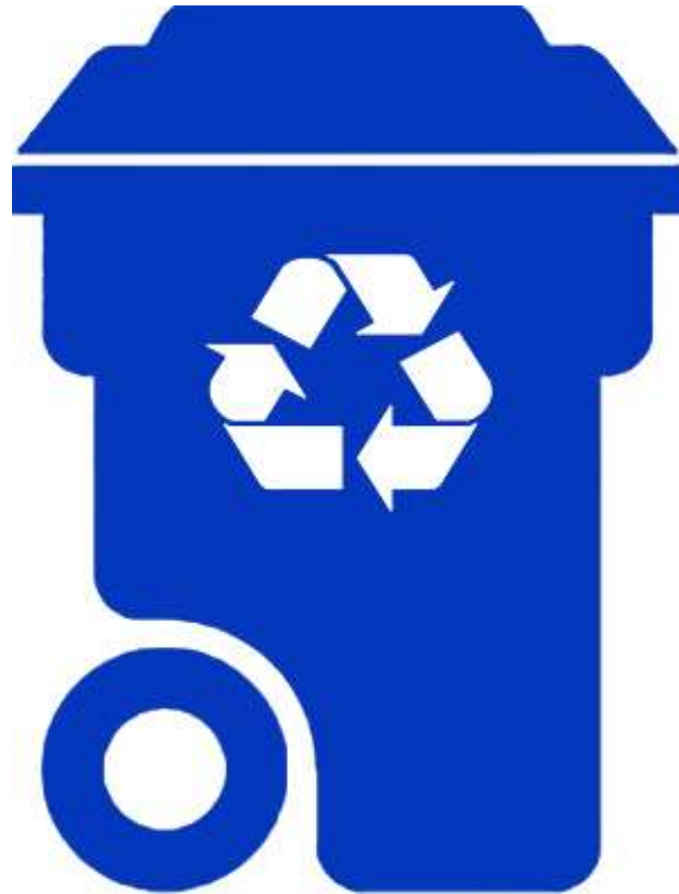
95 gal BLUE RECYCLE collection bi/weekly