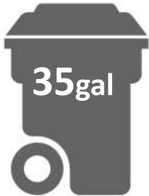
35 gal TRASH