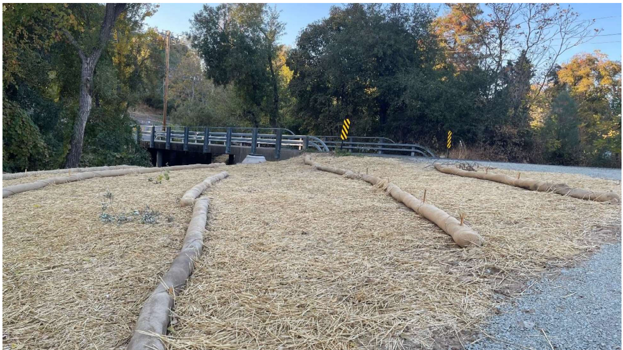
6. Erosion protection provided to facilitate access to manhole