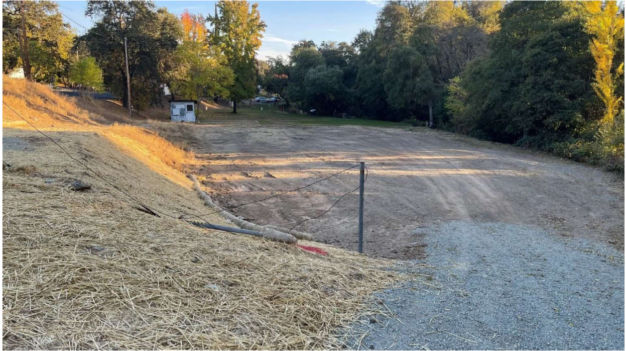
1. Erosion control and all-weather road at park entrance