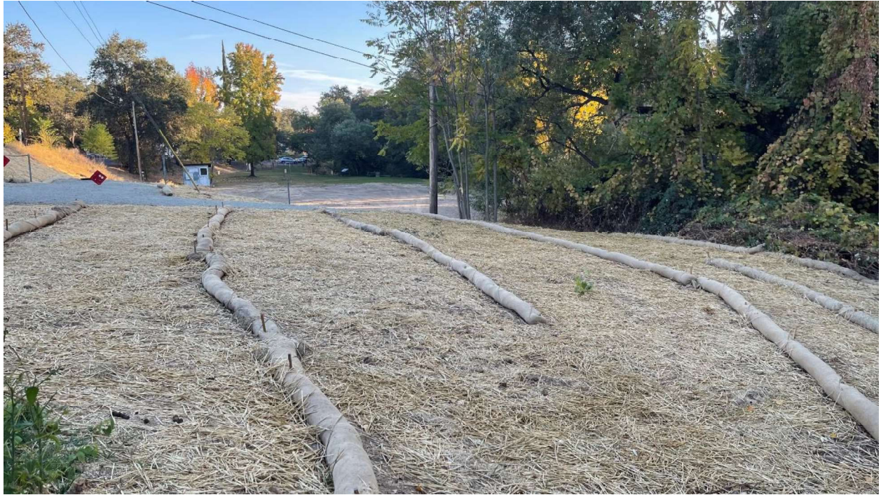
5. Erosion protection provided along bank of Angels Creek