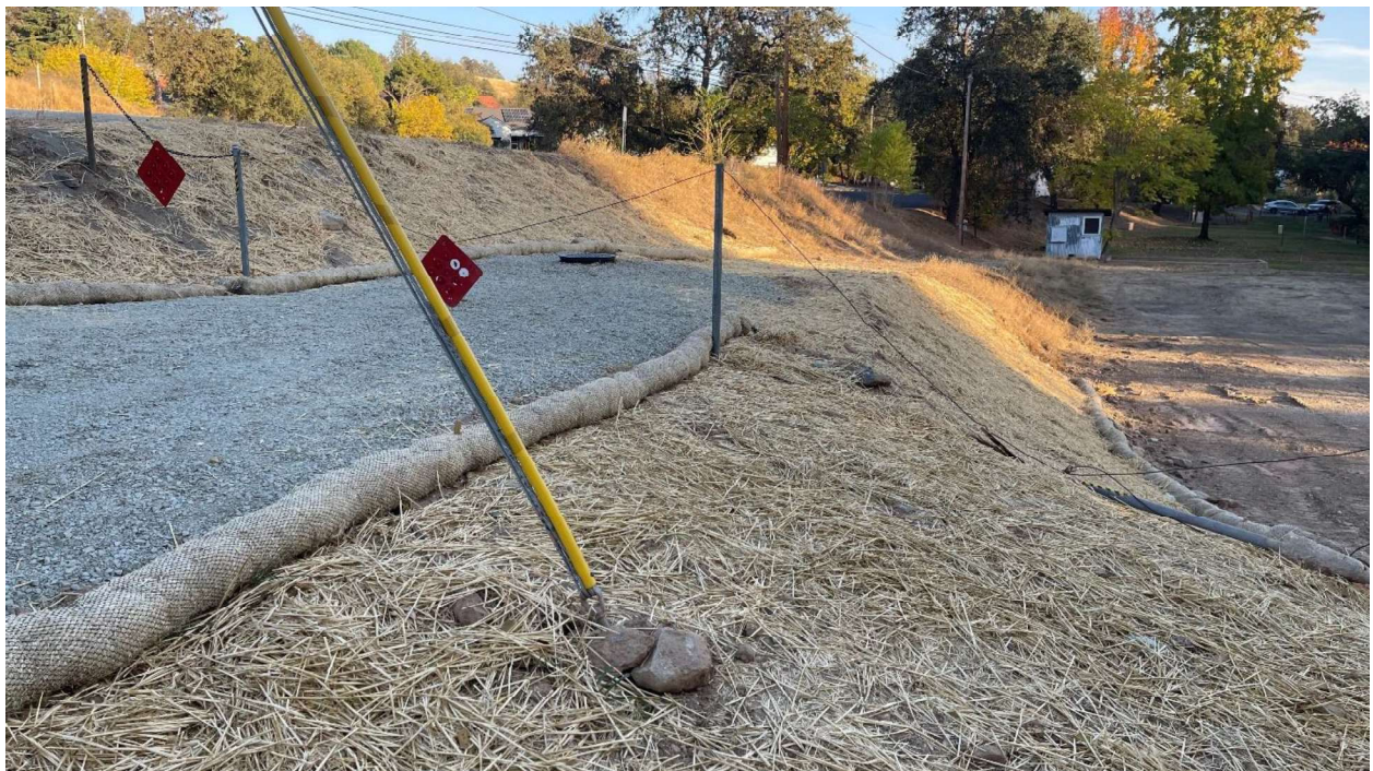
2. Erosion control and all-weather road materials constructed to facilitate access to manhole