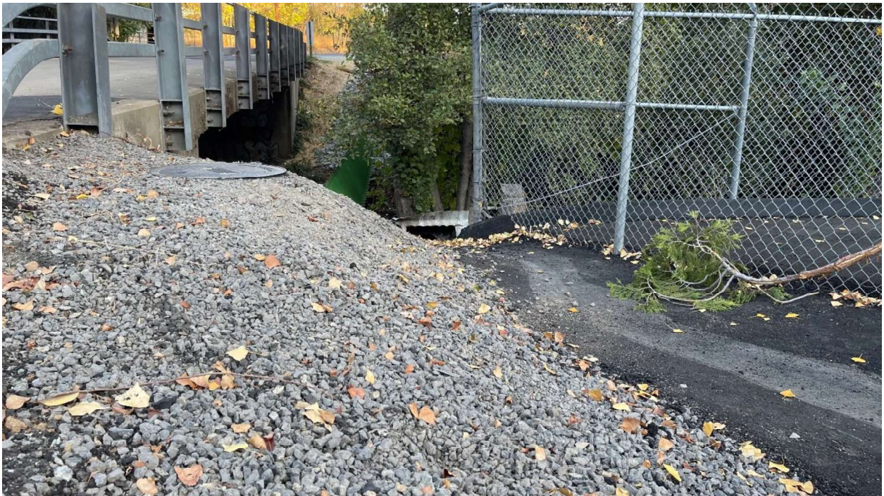
10. AC paving and rock placed to protect bank of Angels Creek