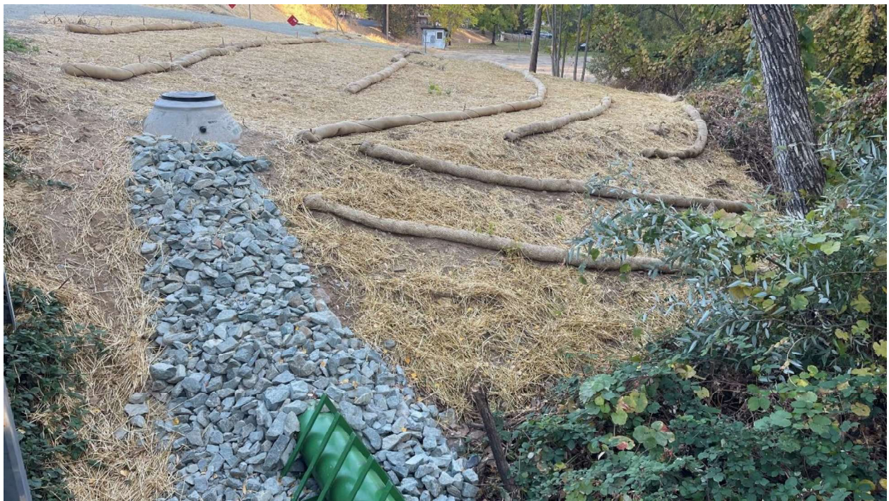
8. Rock slope protection provided along bank of Angels Creek