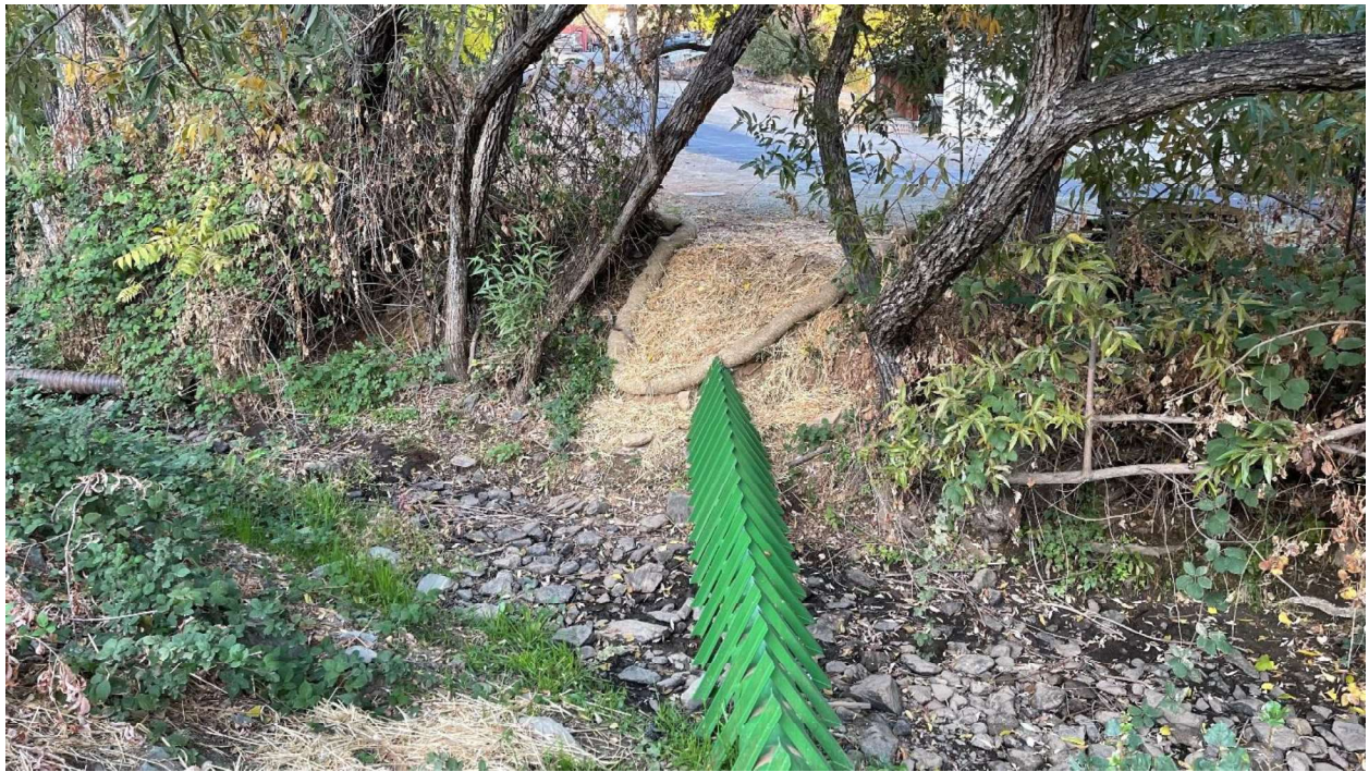
11. Slope erosion control at China Gulch Sewer Crossing