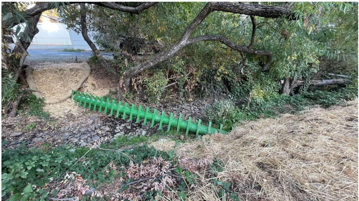
12. Slope erosion control at China Gulch Sewer Crossing