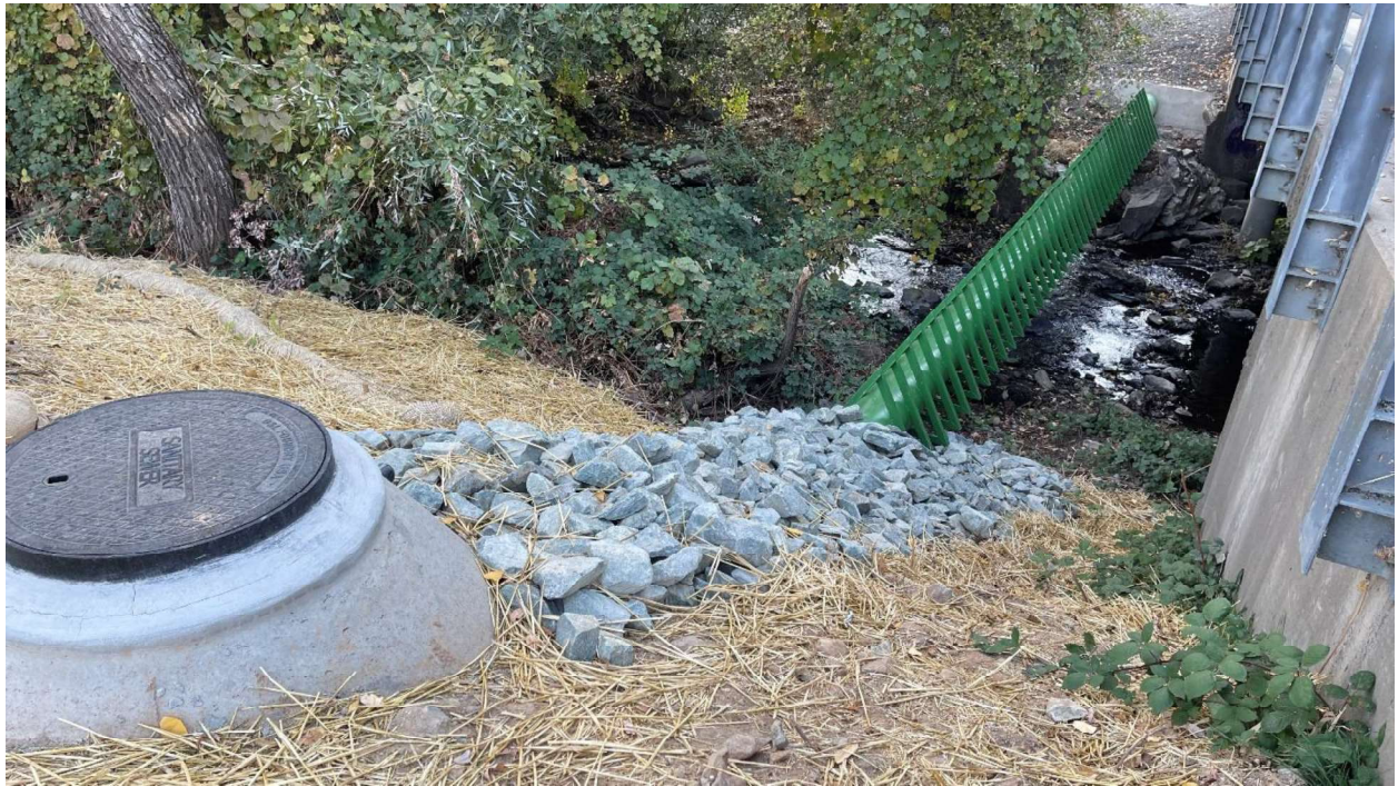
7. Rock slope protection provided along bank of Angels Creek