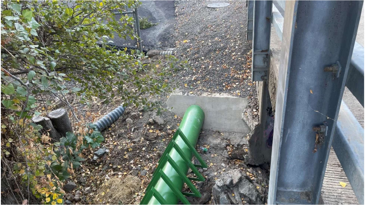
9. Concrete headwall constructed to protect pipe/bank at Angels Creek