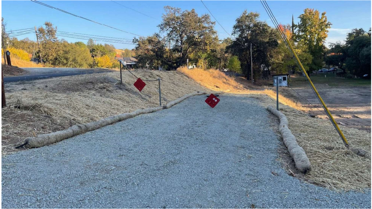
3. All-weather road material provided at park entrance