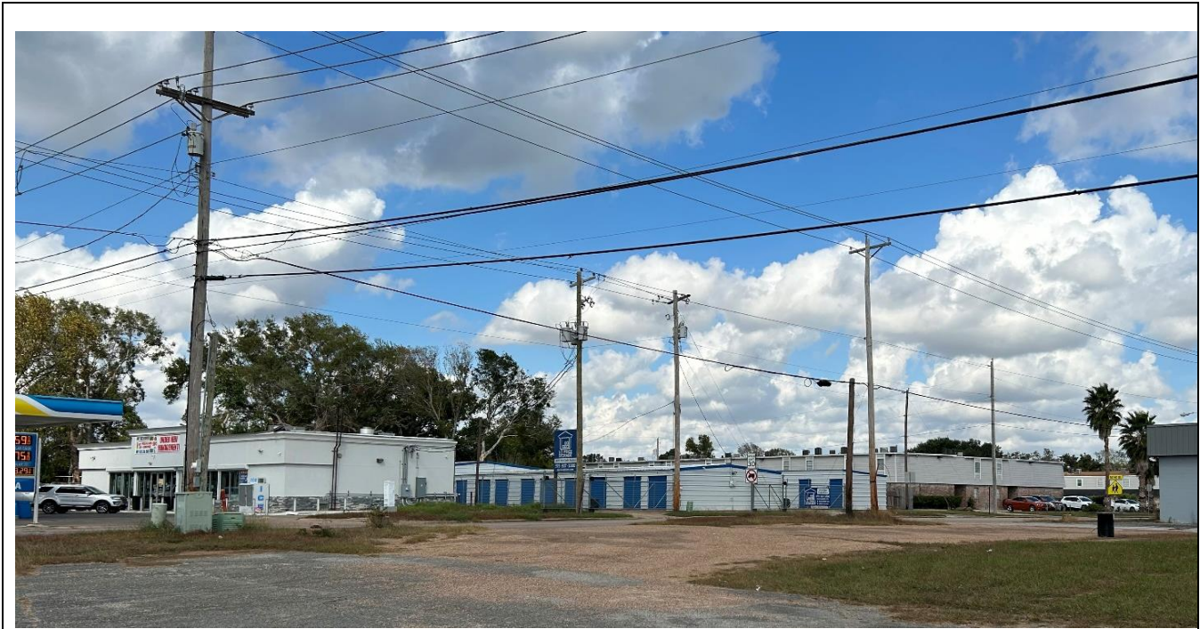
View looking north-easterly along SH288B toward the intersection of Cemetery Road, Site is to the right