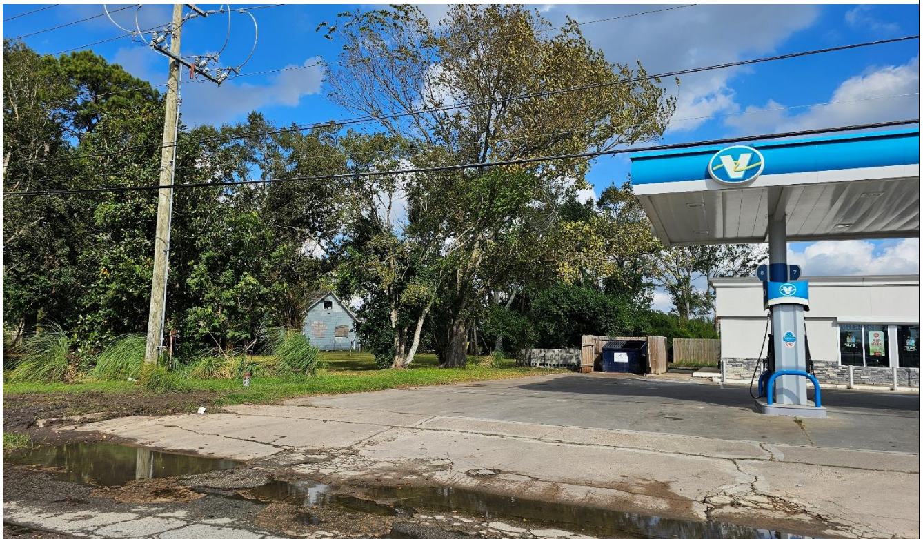
View looking north-easterly from SH288B